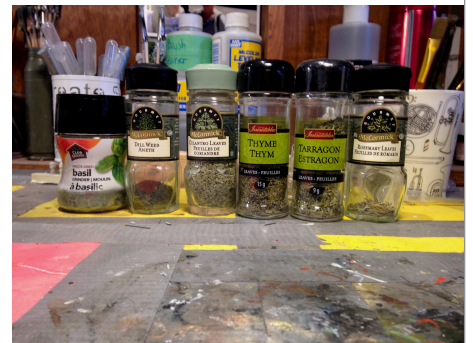
Spices to replicate different ground textures.